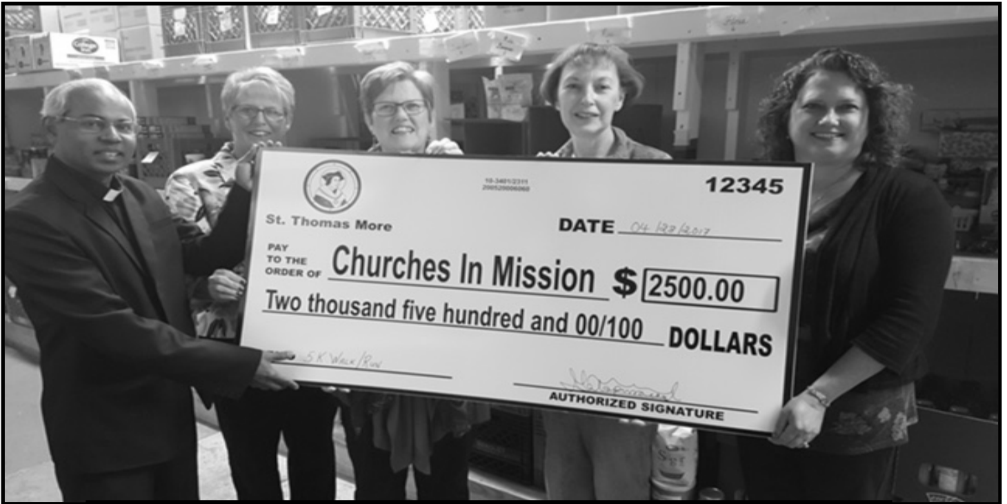
DONATION FROM STM JUBILEE 5K RUN/WALK TO CIM