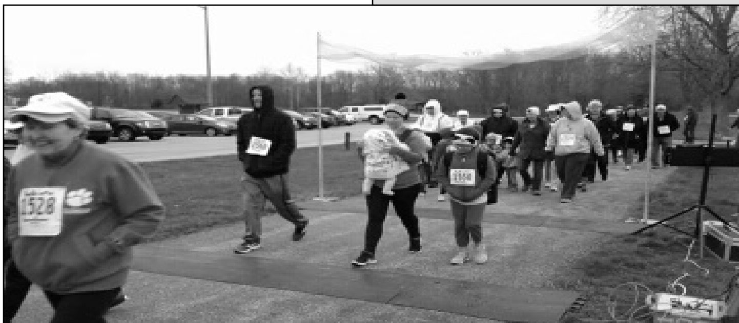
PICTURE FROM A COLD BUT SUCCESSFUL 5 K WALK/RUN

CHECK OUT OUR PARISH WEBSITE www.stm-church.org ON FACEBOOK? GO TO https://www.facebook.com/stthomasmorecatholicchurch/