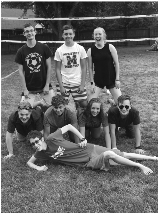
HIGH SCHOOL POOL PARTY

People with office administrative skills, fund raising and/or marketing skills, and organizational skills with supplies & materials