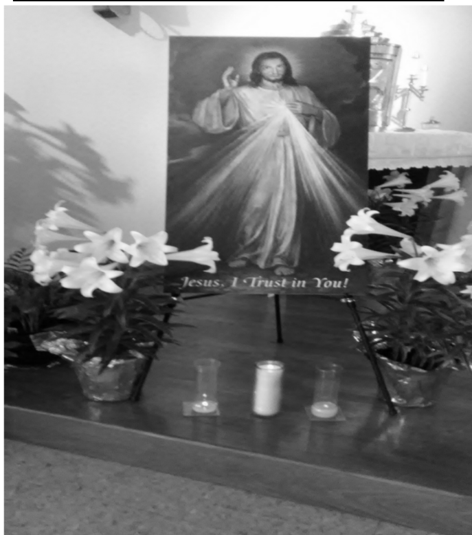
LAST SUNDAY'S CELEBRATION OF DIVINE MERCY!

You can visit www.heargodscall.com for additional information and resources about vocations and discerning a call.